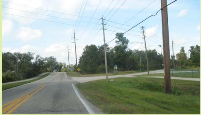
A wide sidewalk ends at Jena Drive along the east side of Enterprise Road.

Potential Constraint: The right of way may be limited, especially toward the intersection of Deltona Boulevard where a turn lane reduces available right of way. If construction is not feasible along Enterprise Road in this location, a sidewalk along the east side of Jena Drive from Enterprise Road to South Fairbairn Drive would provide a connection to the neighborhood to the north of Deltona Middle School.