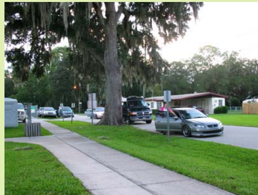
A motorist picks up a student in front of the School along Main Street

Recommendation: Continue to educate parents (and their children) of the proper drop-off and pick-up procedures through flyers, and newsletters, especially at the beginning of the year. Consider placing school staff along the front of the school for the first two weeks of the school year.