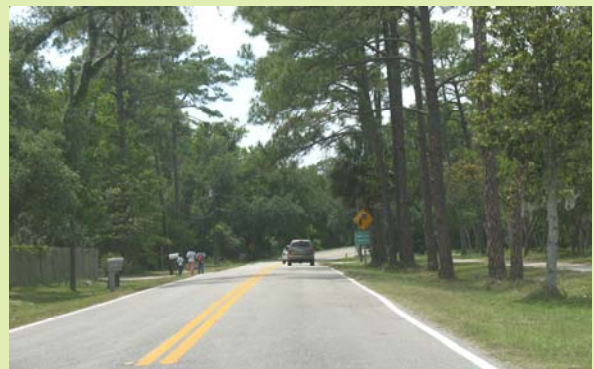
Students walk along the west side of Enterprise Road where the proposed sidewalk would be located.

Recommendation: The continuation of the existing wide sidewalk along the west side of Enterprise Road will provide a sidewalk connection to the planned signalized intersection of Enterprise Road and DeBary Avenue Bypass. The completion of this sidewalk would allow students to cross the DeBary Avenue Bypass at the signalized intersection with a crossing guard (proposed by this Study) to the west side of Enterprise Road. Students living west of Enterprise Road will also be required to cross Main Street where it intersects with the DeBary Avenue Bypass. A crossing guard for this location should be reviewed after the completion of the DeBary Avenue Bypass.