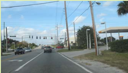
A turn lane at Deltona Boulevard reduces available right of way along the east side of Enterprise Road.