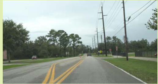
The crossing guard location on Enterprise Road near Deltona Middle School

Recommendation: Maintain this crossing guard location if students are using the guard and are not provided bus transportation. If the sidewalks along Enterprise Road are completed, review this crossing guard location to see if it can be relocated to the intersection of Enterprise Road and the planned DeBary Avenue Bypass. This will allow students to cross at a signalized intersection. The need for a crossing guard should also be reviewed for crossing Main Street at the intersection of the DeBary Avenue Bypass.