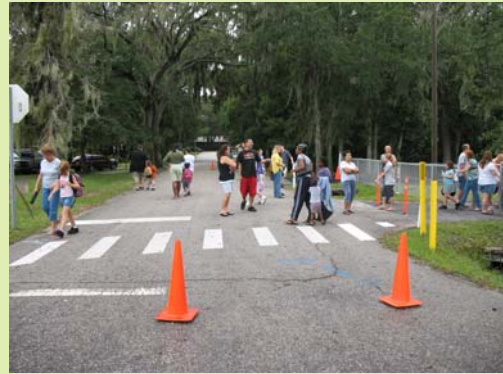
3 rd Street is closed during student arrival and dismissal times, eliminating the need for the guard to supervise two crossings at one time

Finding: Parents drop their children off at several points around the school to avoid the car drop-off line. Many parents also park temporarily and escort their children to the school site/classroom.