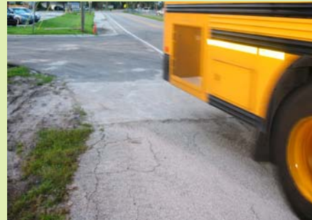
The bus encroaches on the sidewalk at the bus exit.

Finding: The East Central Regional Rail Trail will be co-located with the DeBary Avenue Bypass and is expected to serve Enterprise Elementary School students and Deltona Middle School students. Enterprise Road will intersect the DeBary Avenue Bypass, with a signal planned for this location.