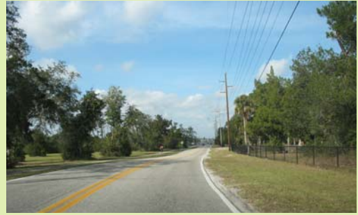
Enterprise Road looking west

Recommendation: Completion of the missing sidewalk gaps will greatly enhance the safety for the pedestrians and bicyclists attending Enterprise Elementary School and Deltona Middle School. The County is reviewing the right-of-way conditions along Enterprise Road to determine if the continuation of the sidewalk is feasible. Sidewalk completion along the east and west side of Enterprise Road is detailed further as recommended priority projects at the end of this chapter.