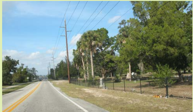
Enterprise Road looking north (near the cemetery)