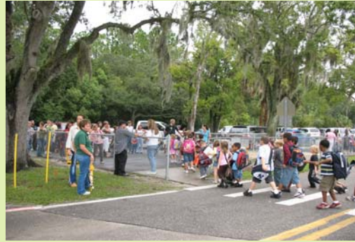
Students cross Main Street to the student pick-up area where parents wait.

Recommendation: Continue efforts to provide on-campus student pick-up/drop-off. Design the access to the proposed on-campus parking to avoid conflicts with pedestrians and bicyclists using the Main Street sidewalk.