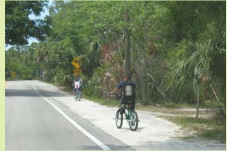
The asphalt sidewalk is flush to the adjacent roadway along Main Street.