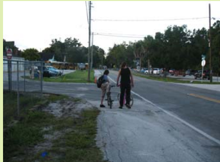
The sidewalk is difficult to distinguish from the roadway.